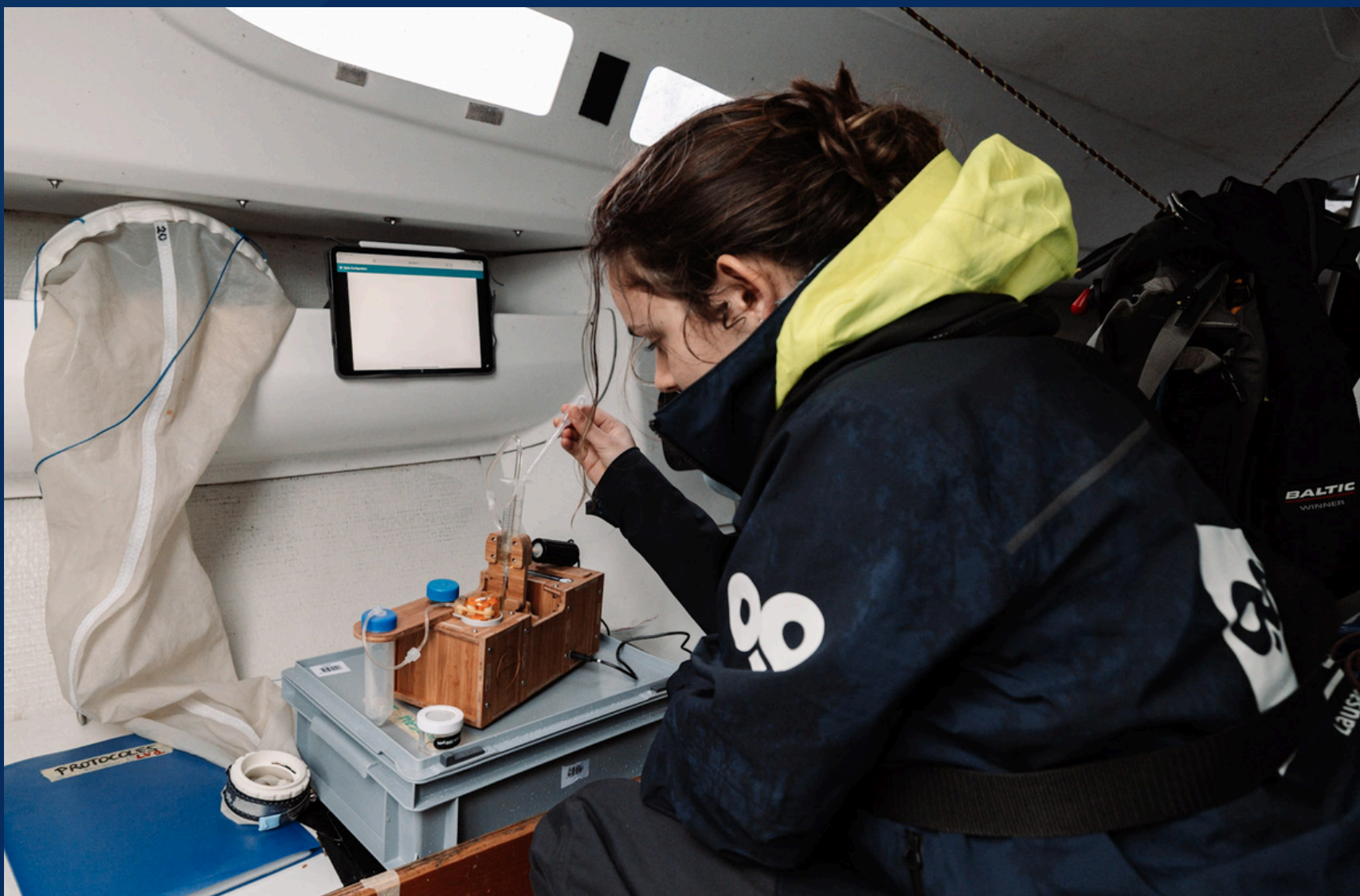
Sailowtech's member working on the planktoscope during an expedition

A Planktoscope is a specialized optical instrument designed for the observation and analysis of plankton in aquatic samples. It is suitable for research, education, and environmental monitoring.